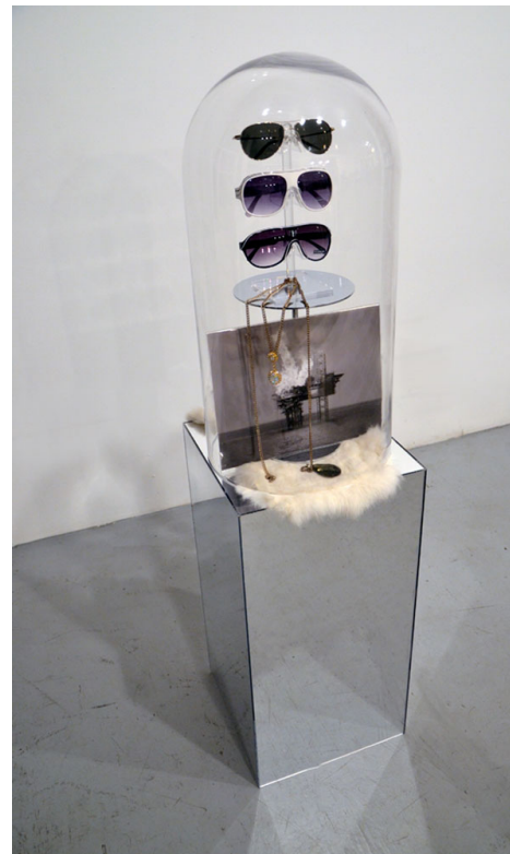
[TK], 2010 Mixed media on pedestal (24 x 12.5 x 12.5 inches / 60.96 x 31.75 x 31.75 cm); Sculpture: 23.5 x 12 x 12 inches (59.69 x 30.48 x 30.48 cm); 69,85 x 31,75 x 31,75 cm # MECK0086