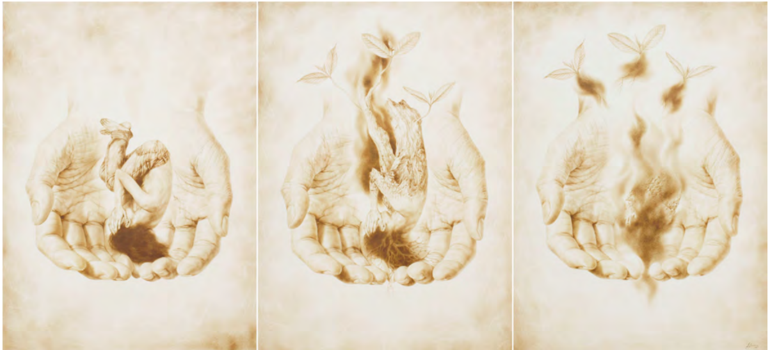
Alfredo Esquillo Floater, 2015 Oil on paper 111,76 x 81,28 cm each work of paper / 111,76 x 243,84 cm, overall; framed ESQU0008

Exhibition History: 2015 Transfiguration, ARNDT Berlin