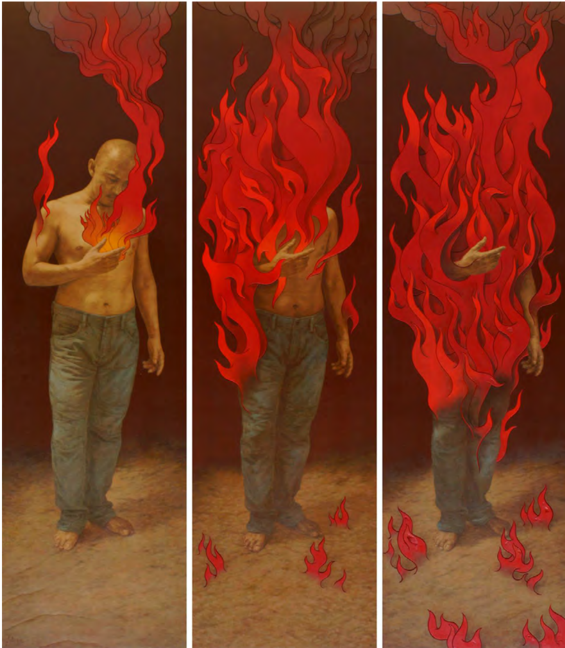
Alfredo Esquillo Man on fire, 2015 Oil on ethylene-vinyl acetate (EVA) panel 217 x 65,5 cm, each panel, framed / 217 x 196,5 cm, overall, framed. Brown box frame with acrylic glass ESQU0004

Exhibition History: 2015 Transfiguration, ARNDT Berlin