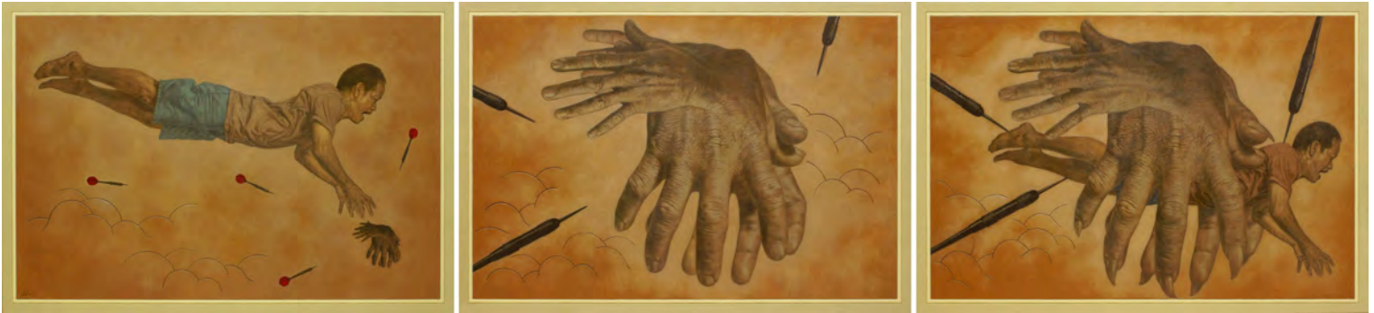
Alfredo Esquillo Prey Catching Prey, 2015 Oil on ethylene-vinyl acetate (EVA) panel 116 x 167 cm, each panel, framed / 116 x 501 cm, overall, framed. Brown box frame with acrylic glass ESQU0005

Exhibition History: 2015 Transfiguration, ARNDT Berlin