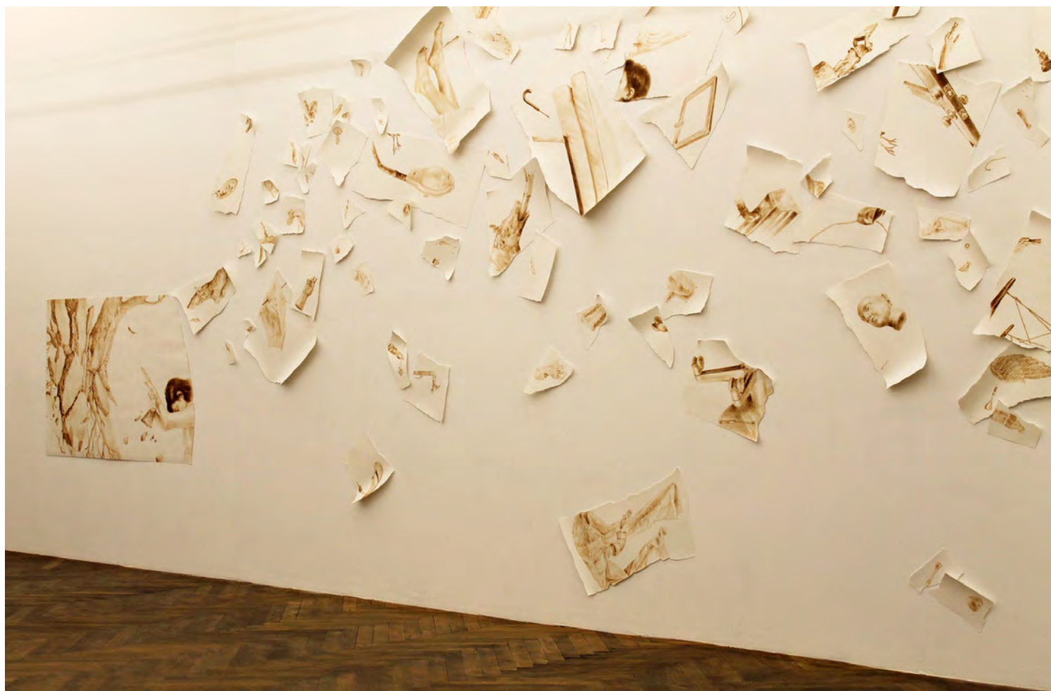
Alfredo Esquillo Saved By The Bed, 2014 Oil on paper variable dimensions, 84 parts ESQU0010

Exhibition History: 2015 Transfiguration, ARNDT Berlin