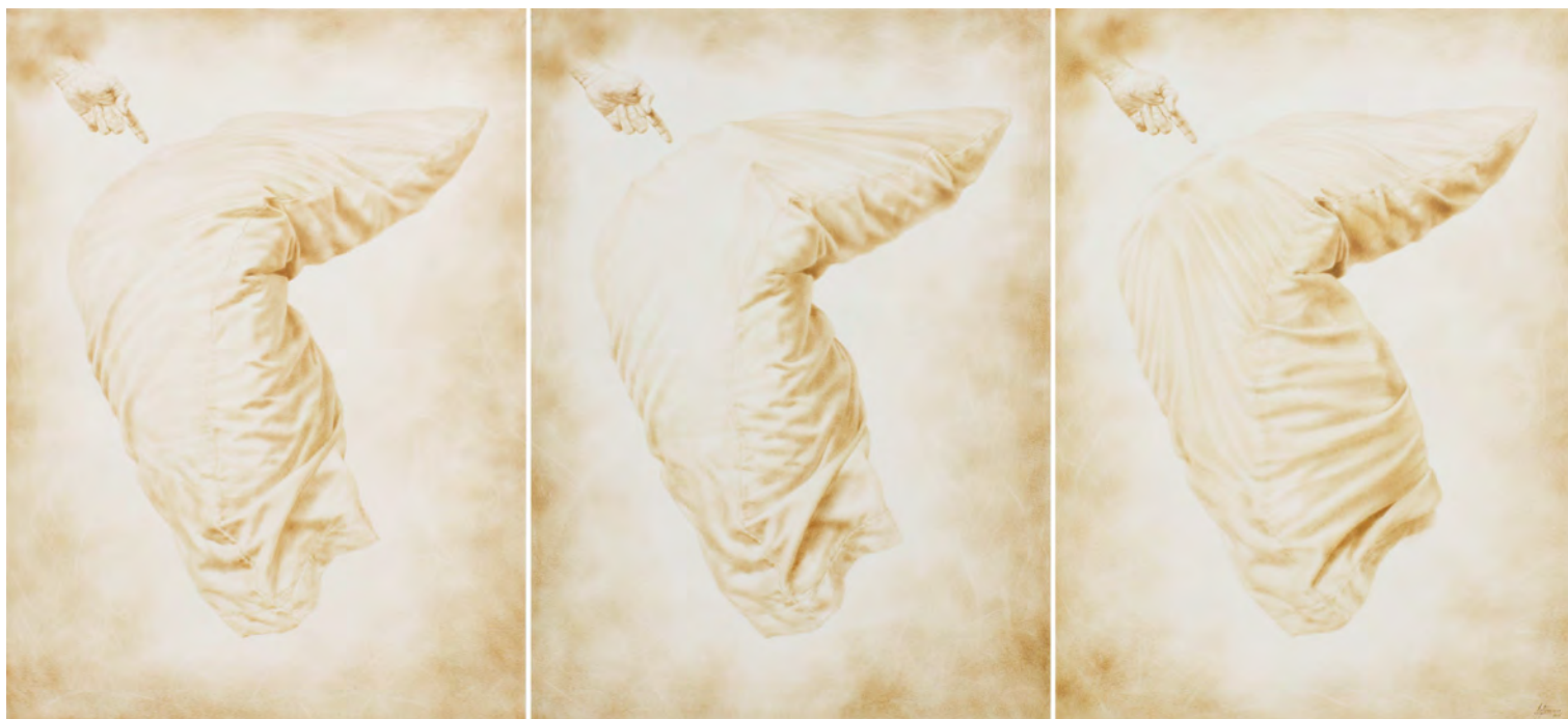
Alfredo Esquillo The Creation, 2015 Oil on paper 111,76 x 81,28 cm each work of paper / 111,76 x 243,84 cm, overall; framed ESQU0009

Exhibition History: 2015 Transfiguration, ARNDT Berlin